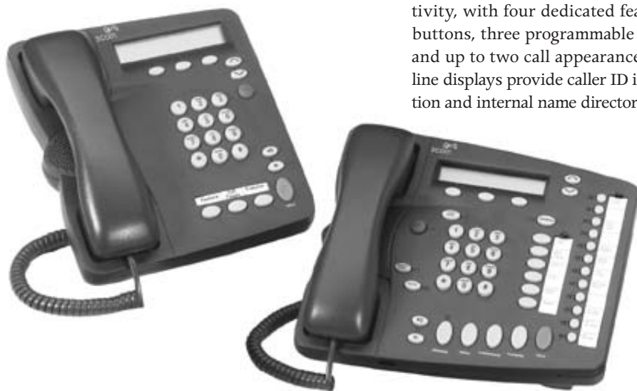
Right to Left: 3Com NBX Business Phone offering easy access to a full suite of features and services, including connectivity to Palm Computing OS-enabled organizers; 3Com NBX Basic Phone, ideal for locations needing intelligent, multiline IP/Ethernet connectivity at an exceptionally affordable price.

These phones offer affordable, simple, and powerful 10/100 Ethernet connectivity, with four dedicated feature buttons, three programmable buttons, and up to two call appearances. Two-line displays provide caller ID information and internal name directory access.