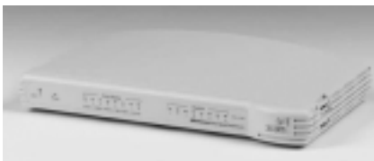
OfficeConnect Dual Speed Switch 8 Plus