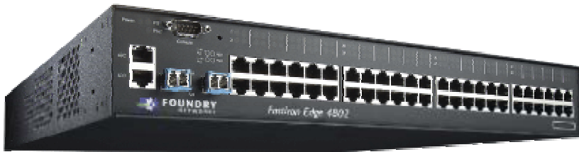
■ Figure 3: FastIron Edge 4802

FES2402-PREM: 24 ports 10/100Base-TX plus 2 ports integrated 1000Base-T (RJ45) paired to 2 slots 1000Base-X (mini-GBIC), Full Layer 2 & 3 and one hot-swappable, field replaceable AC power supply; Occupies 1.5 RU