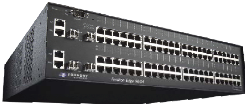
■ Figure 4: FastIron Edge 9604

FES9604: 96 ports 10/100Base-TX plus 4 ports integrated 1000Base-T (RJ45) paired to 4 slots 1000Base-X (mini-GBIC), Full Layer 2 & Base Layer 3 and one hot-swappable, field replaceable AC power supply; Occupies 2.5 RU