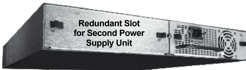
■ Figure 5: FastIron Edge Switch Rear View

Every FastIron Edge Switch ships with either a single AC or DC power supply. Each FES supports two hot-swappable, load-sharing AC, DC, or combined AC and DC, power supply units for unbeatable power redundancy and deployment flexibility. All FES share the same common AC (RPS5) and DC (RPS5-DC) power supply units, further reducing equipment sparing costs and decreasing administrative expenses while, at the same time, increasing overall network serviceability, reliability, and availability. All of the power redundancy features normally available only from a modular chassis are built-in to the FES – a compact, easy to install and manage, fixed-port device.