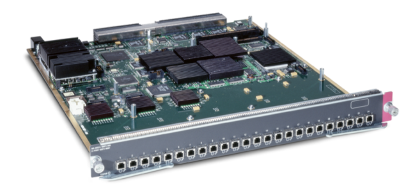
Figure 3. CEF256-Based 100BASE-FX Fiber Interface Module (part number WS-X6524-100FX-MM)