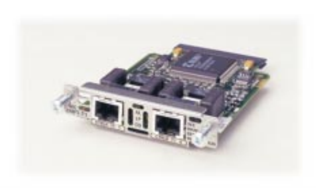
Figure 1 Cisco Dual Port T1/E1 Multiflex Voice/WAN Interface Card

VWIC-1MFT-T1, VWIC-2MFT-T1, VWIC-2MFT-T1-D1, VWIC-1MFT-E1, VWIC-2MFT-E1, VWIC-2MFT-E1-DI, VWIC-1MFT-G703, VWIC-2MFT-G703